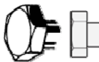
Figure 3. Bolt Heads Available at Ti64

We Currently stock metrics, SAE is 3-5 weeks lead time